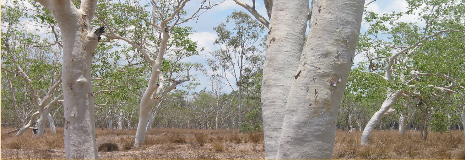
The Mareeba Tropical Savanna and Wetland Reserve Nature Refuge covers 2000 ha and supports over 200 bird and more than 20 mammal species.