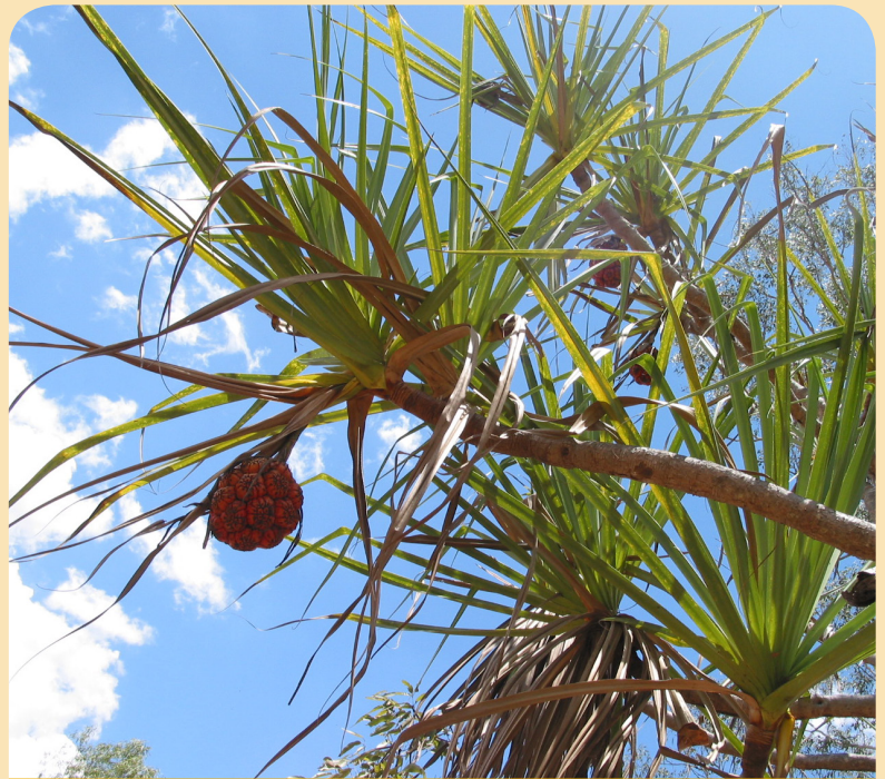
Native to northern Australia, the Pandanus Palm is a versatile plant with a range of traditional uses.

The Muluridji Tribal Aboriginal Corporation has been established as the Prescribed Body Corporate to manage the native title rights on behalf of all native title holders.